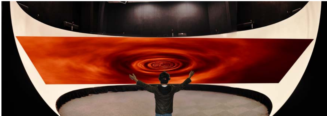
Figure 1: A performer tries to control the sounds and the tunnel properties (i.e. colour and speed) generated from his EEG, by adjusting the mental states associated with the heard sound and shown graphics.

The immersive room offers a unique and powerful platform to represent brain waves in a tangible fashion. Although neural feedback has been investigated for quite some time now, it has never been implemented in an interactive and immersive room. Such novel representation of brain signals can be valuable for therapy, diagnosis, entertainment, and arts. Indeed, several psychological and medical studies have confirmed that virtual immersive activity is enjoyable, stimulating, and can have a healing effect. These studies have also shown that the effect is stronger with virtual reality (VR) feedback than with simple 2D feedback [37-40].